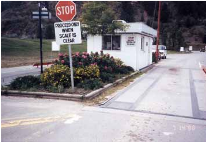
Landfill Weigh Scale

In 1991, the amount of waste buried equalled 1.2 metric tonnes for every man, woman and child. In 2003, the amount was 0.75 metric tonnes. In 2006, the amount increased to 0.8 metric tonnes.