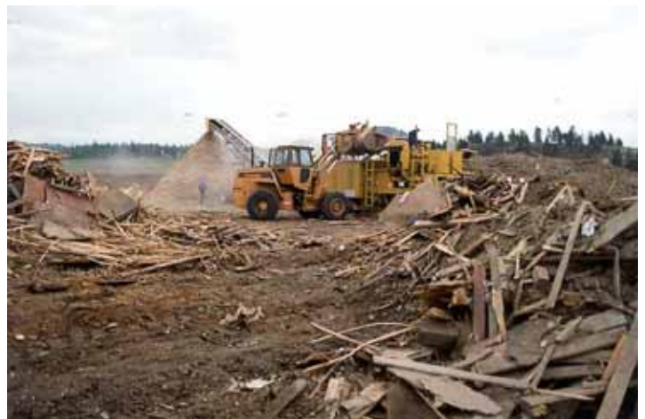
Wood Chipping at Landfill

In July 2000, a residential curbside recycling collection program was initiated. This Blue Bag Recycling Program helped the Central Okanagan to reduce waste by providing an easy and convenient way to recycle. This program has doubled collection of recyclable materials over the depot-only system.